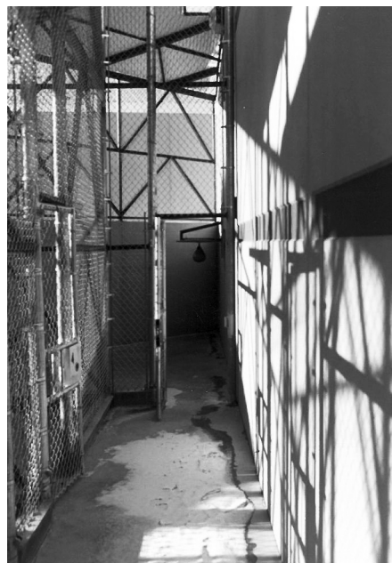
Exercise cages for prisoners at the Penitentiary of New Mexico near Santa Fe.

Here in New Mexico, the fiscal impact of the use of solitary confinement is less clear. Yet examining the staffing data by custody level is illuminating. The Penitentiary of New Mexico facility in Santa Fe holds roughly the same number of prisoners at the lower security Level II as it does in the higher security Level V and Level VI, but the number of custody staff required at the three levels is 52, 143, and 151, respectively. The solitary confinement levels in New Mexico state prisons require almost three times the staffing, and presumably three times the staffing costs.