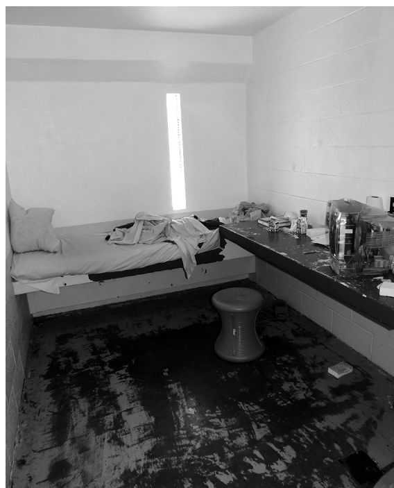
A segregation unit operated by NMCD.

NMCD is now looking at new ways to reduce the use of solitary confinement in its facilities. In June 2012, the NMCD invited the Vera Institute of Justice ( www.vera.org ) to